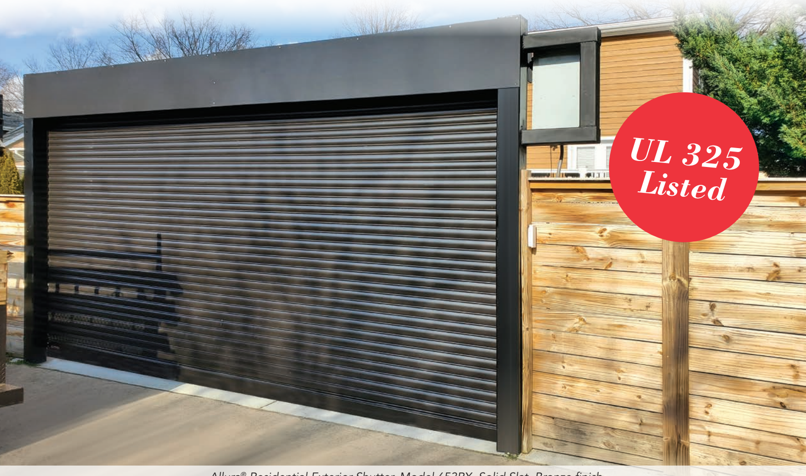
Allura® Residential Exterior Shutter, Model 653RX, Solid Slat, Bronze finish