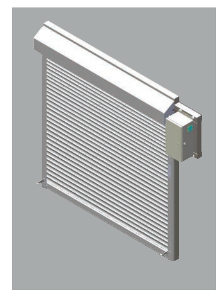
Rendering: Allura® Residential Exterior Shutter system